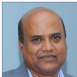
R Chandrashekaram Joint Commissioner, Department of Labour, Government of Telangana