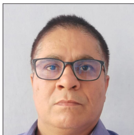
Sarveshwar Shukla Joint Commissioner, MSME and Export Promotion, Government of Uttar Pradesh