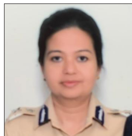
Aswati Dorje Joint Commissioner, Nagpur City Police