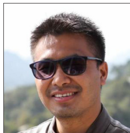
Armstrong Pame Deputy Commissioner, District Administration Tamenglong