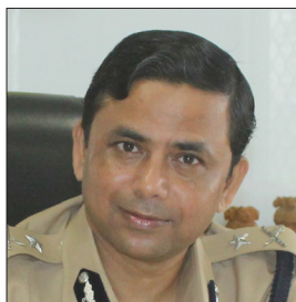
Quaiser Khalid Commissioner of Police, Mumbai Railway Police Commissionerate